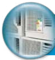
空調機 Room Air Conditioners

The Mandatory Energy Efficiency Labelling Scheme covers the following 5 types of prescribed products: