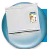
冷凍器具 Refrigerating Appliances