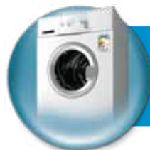
洗衣機 Washing Machines