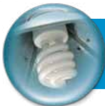
緊湊型熒光燈（慳電膽） Compact Fluorescent Lamps (CFLs)