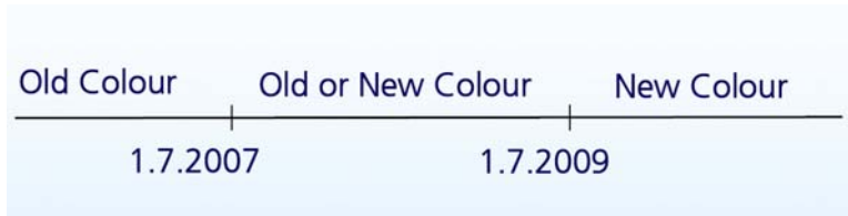
Figure 2 – Implementation Schedule