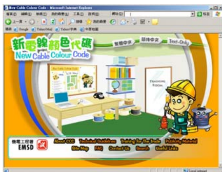
Figure 6 – Cable colour change web corner

11. Three mass-scale training sessions have been organized since November 2005. These training sessions provide an interactive platform for frontline electrical workers to discuss practical issues in relation to the change. Train-the-trainer workshops are also in progress. After the training, the participants can further train up their fellow colleagues of their respective companies/organizations. Besides electrical workers in the private sector, regular training sessions have also been arranged for the governmental staff. For the web-based on-line self-learning training, a web corner has been created under the EMSD's homepage ( www.emsd.gov.hk ). Self-learning training materials have been uploaded to the web-corner. REWs can study the training materials, answer some technical questions and enter their REW nos. for record on line anytime.