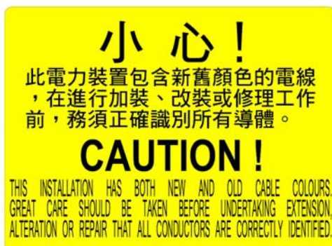
Figure 3 – Yellow warning notice in Installation Guidelines

9. The risk associated with the change has been carefully evaluated, and installation guidelines have been devised to prevent technical errors and mitigate the identified risks. Noting that so far there is no electrical incidents arising from cable colour change in the U.K. [Ref. 5], the Working Group has made references to their practices and guidelines [Ref. 6] in devising the local installation guidelines. Registered Electrical Workers (REW) and Registered Electrical Contractors (REC) will be provided with the installation guidelines and they are also required to attend relevant training courses. In addition, the Code of Practice for the Electricity (Wiring) Regulations published under the Electricity Ordinance will be amended to reflect the new requirement.