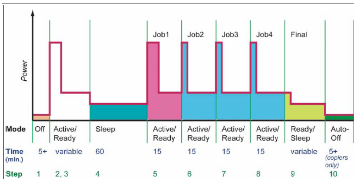
Figure 1 – Typical TEC measurement procedures for Multifunction devices

Figure 1 shows a graphic form of the measurement procedure. Note that products with short default-delay times may include periods of "Sleep" within the four job measurements, or Auto-off within the "Sleep" measurement in the Step 4. Also, print-capable products with just one "Sleep" mode will not have a "Sleep" mode in final period. Step 10 only applies to MFD without print-capability.