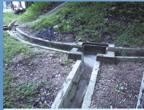
排水溝附近 adjacent to drainage