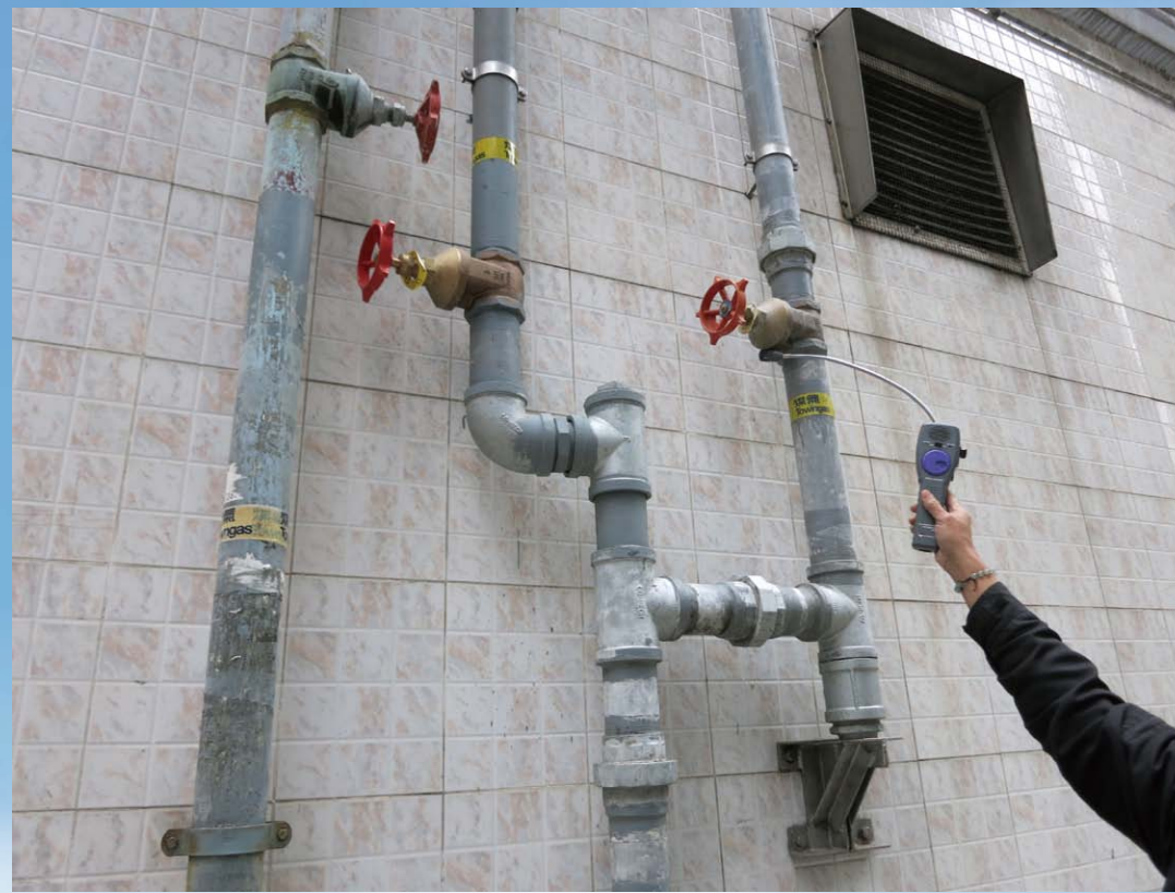
樓宇供氣分喉 Service Riser