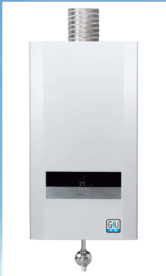
氣體熱水爐 Gas Water Heater

Regular Safety Inspection Every 18 Months