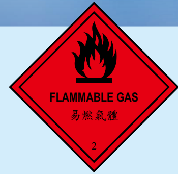
易燃物品 flammable material