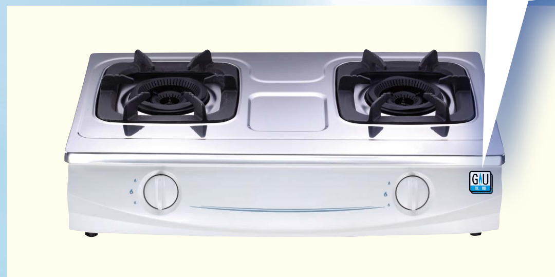
氣體煮食爐 Gas Cooking Appliance