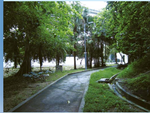
林木和植物附近 adjacent to vegetation