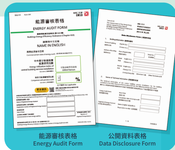
能源審核表格 Energy Audit Form