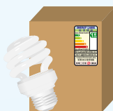
慳電膽 Compact Fluorescent Lamps (CFLs)