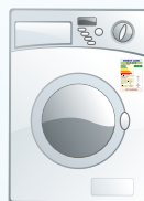
洗衣機 Washing Machines ( 額定洗衣量多於7公斤 但不多於10公斤 ) ( Rated washing capacity exceeding 7kg but not exceeding 10kg )