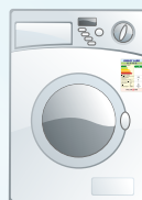
洗衣機 (額定洗衣量不多於7公斤) Washing Machines (Rated washing capacity not exceeding 7kg)