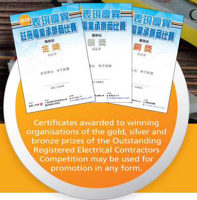
Certificates awarded to winning organisations of the gold, silver and bronze prizes of the Outstanding Registered Electrical Contractors Competition may be used for promotion in any form.