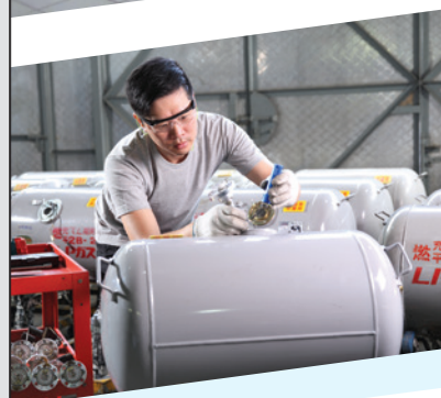
An LPG Fuel Tank Workshop