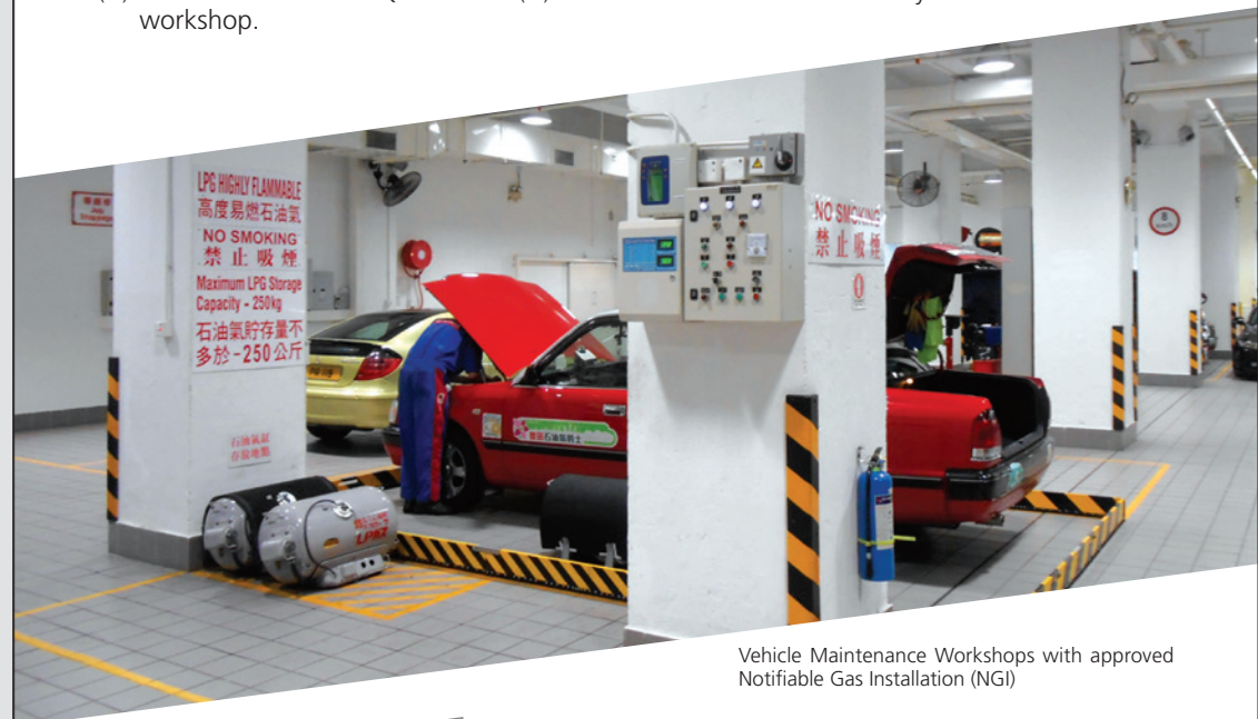
Vehicle Maintenance Workshops with approved Notifiable Gas Installation (NGI)