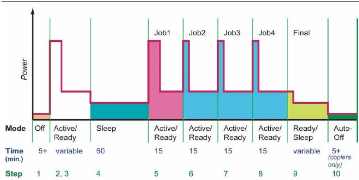
Figure 1 – Typical TEC measurement procedures for Multifunction devices

Figure 1 shows a graphic form of the measurement procedure. Note that products with short default-delay times may include periods of “Sleep” within the four job measurements, or Auto-off within the “Sleep” measurement in the Step 4. Also, print-capable products with just one “Sleep” mode will not have a “Sleep” mode in final period. Step 10 only applies to MFD without print-capability.