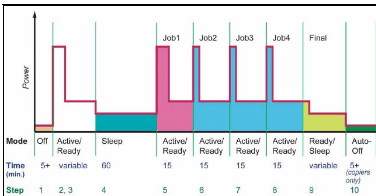
Figure 1 – Typical TEC measurement procedures for Fax Machine

Figure 1 shows a graphic form of the measurement procedure. Note that products with short default-delay times may include periods of "Sleep" within the four job measurements, or Auto-off within the "Sleep" measurement in the Step 4. Also, print-capable products with just one "Sleep" mode will not have a "Sleep" mode in final period.