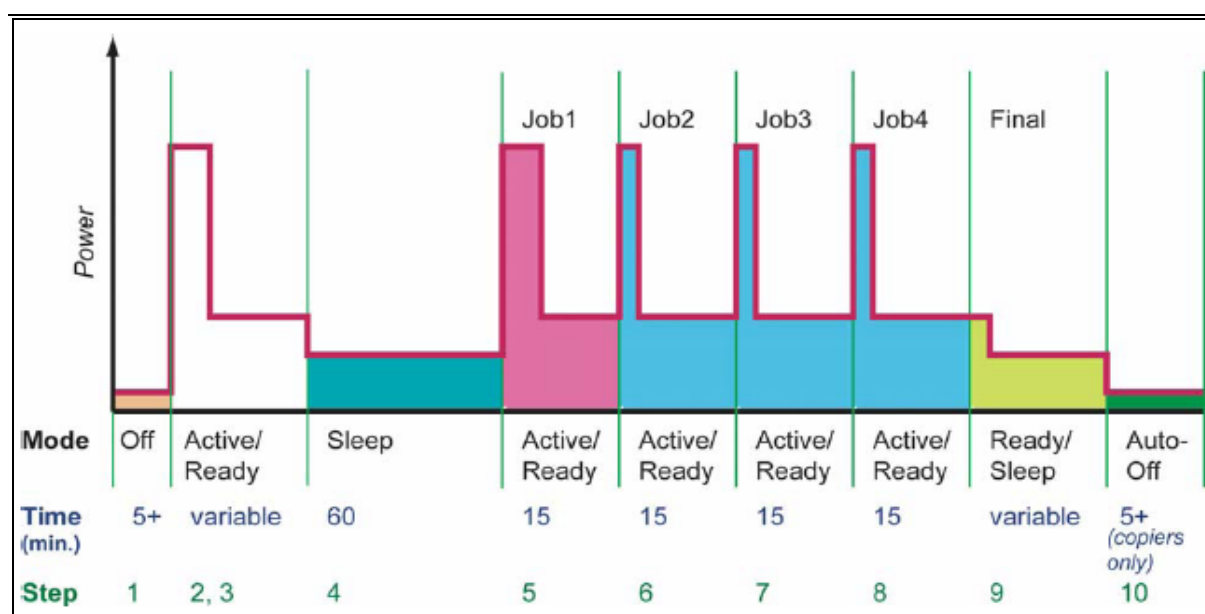
Figure 1 – Typical TEC measurement procedures for Printers

Figure 1 shows a graphic form of the measurement procedure. Note that products with short default-delay times may include periods of "Sleep" within the four job measurements, or Auto-off within the "Sleep" measurement in the Step 4. Also, print-capable products with just one "Sleep" mode will not have a "Sleep" mode in final period.