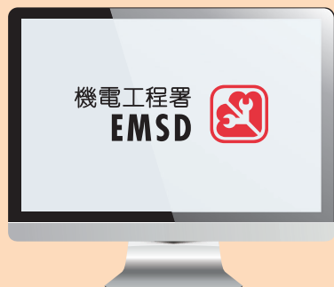
機電工程署網頁 EMSD Website