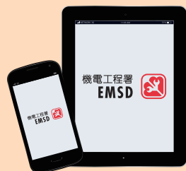
機電工程署流動應用程式 EMSD Mobile App