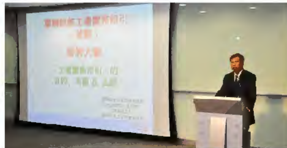
Some photos taken at the two consultation forums held at EMSD Headquarters