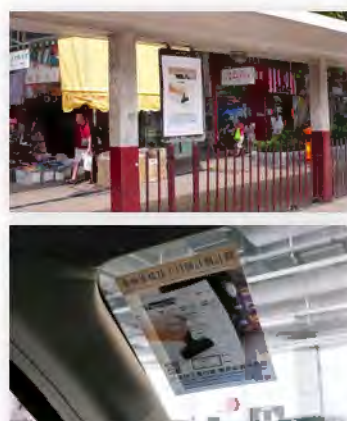
Poster, leaflet and vehicle licence plastic sticker