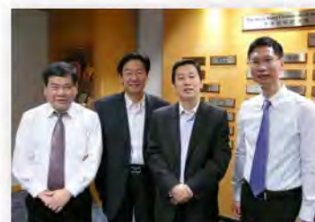
Promoting the Voluntary Registration Scheme for Vehicle Maintenance to the Hong Kong Federation of Insurers