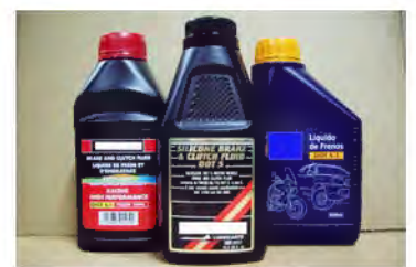
Brake fluids DOT 5 and DOT 5.1

Most users of DOT 5.1 are car lovers who wish to enhance the brake function of their cars by switching to higher-end brake fluids.