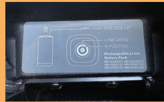
The battery installation method, placement of the positive and negative terminals and part numbers of compatible batteries are specified on the battery compartment.