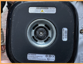
The bottom design of an EMC battery.