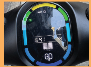
The battery level is clearly displayed on the dashboard of EMCs, which is simple and easy to understand.