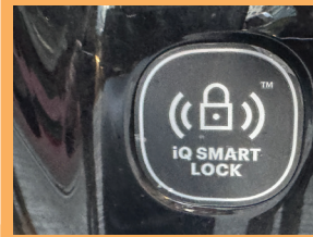
The EMCs are equipped with a sensor-activated unlocking function.