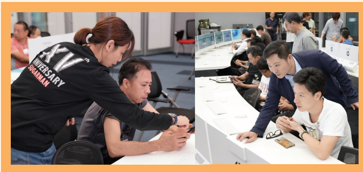
The VMRU staff actively responded to questions from the mechanics.

This workshop not only provided the sector with a valuable opportunity for learning and networking, but also tangibly drove digital transformation of the vehicle maintenance industry, laying a solid foundation for promoting online registration services and continuously enhancing the professional standards of the trade in the future.