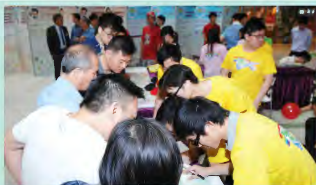
EMSD staff are on hand to introduce the scheme to vehicle mechanics and help them register