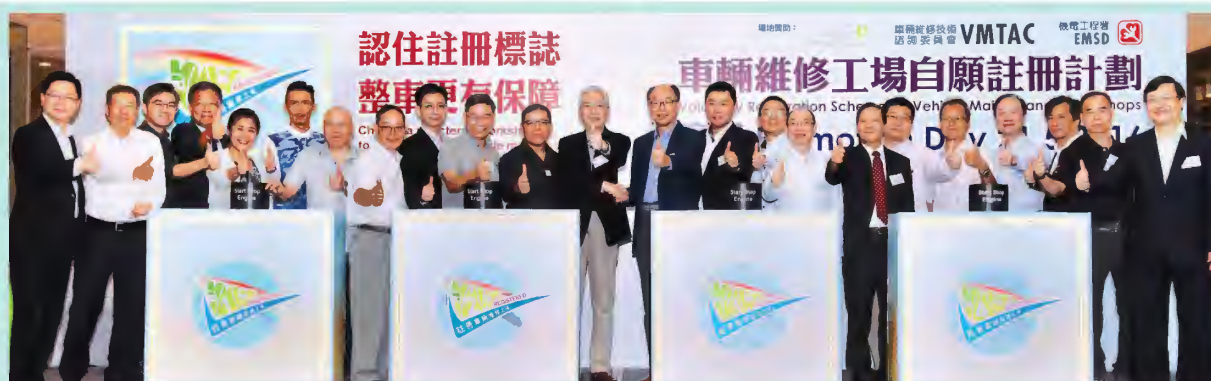
Guests pose for a group photo after officiating at the lighting ceremony