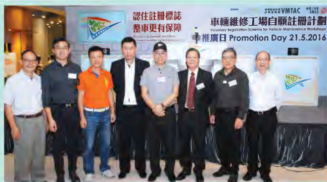
Vehicle Maintenance Technical Advisory Committee members pose for a group photo