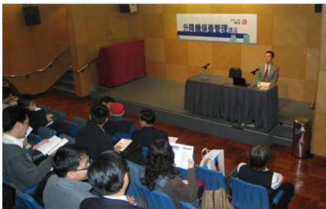
Conducting seminars to promote the principles of "shared responsibility" and "user surveillance" of lift safety

To promote the principles of "shared responsibility" and "user surveillance" of lift safety, we conducted extensive publicity activities including 29 seminars for over 2,500 lift owners, building management staff and members of incorporated owners in 2009.