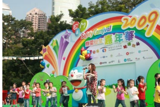
The E&M Safety Carnival, a highlight of the E&M Safety Campaign 2009 was held in Victoria Park in 17, 18 November 2009 and attracted over 10,000 participants

The annual E&M Safety Campaign is a joint effort between EMSD and key industry players from various sectors including electricity, gas and energy, public transport and entertainment, housing and estate management, and trade association. It is one of our most important initiatives in raising public awareness of E&M safety, gas safety and energy efficiency. Entering its ninth year in 2009, the campaign again featured a mix of mass media and community programmes. A two-day outdoor carnival – highlight of the campaign – attracted over 10,000 people over a weekend in October 2009.