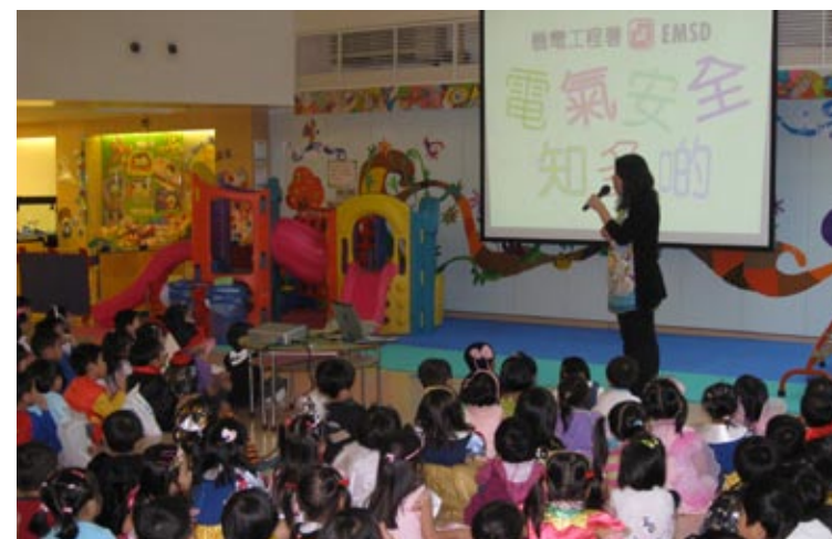
"Our Safety Ambassadors visited kindergartens, primary schools and elderly centres to promote electrical & mechanical safety and energy efficiency to the public."

During the year of 2009, we processed some 161,127 cases relating to gas safety, electricity safety, lift and escalator safety, amusement ride safety, builder's lift and tower working platform safety, energy efficiency, and around 400 cases about traffic signals, footbridge and subway lighting. Our overall performance was maintained at a very high level with 33 out of a total of 37 pledges achieving a perfect 100% compliance. Although we have very good achievements in our past performance which were made possible by the joint efforts of all our staff, we are in no way complacent and are continuing to improve our services through ongoing enhancement of all pledged items and introduction of new services where appropriate. Details of our performance in the year 2009 are as follows: