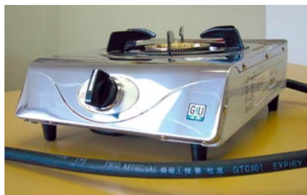
Approved Gas Appliance and Tubing