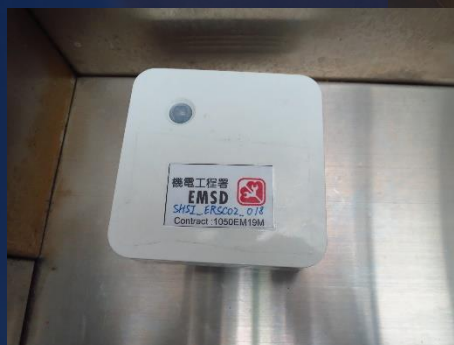
Temp & Humidity Sensor