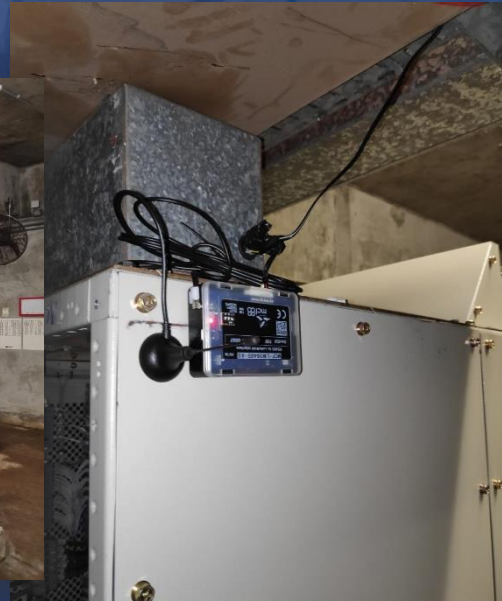
LoRA RS485 Device