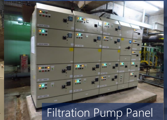
Filtration Pump Panel