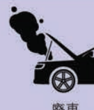
廢車 回收公司 Scrapping Company