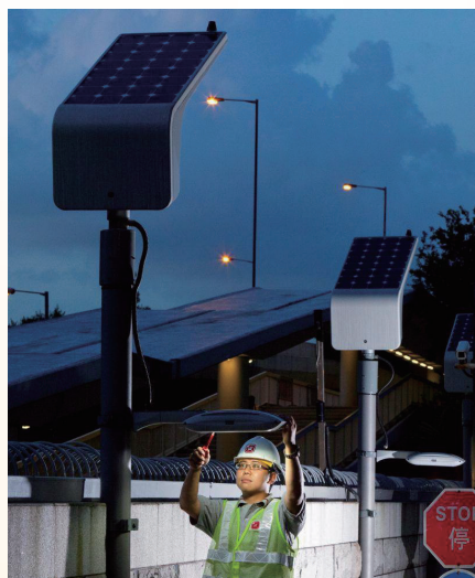
香港警察總部的太陽能街燈。 Solar street lights at the Police Headquarters.